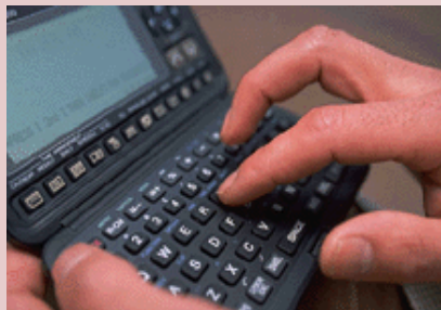
Tools to Succeed in the Real World

The Professional World of Business is a series of fun, informative, interactive sessions hosted by Harris Corporation, Local Professionals and the Penfield FIRST Robotics Team. These sessions include presentations, guest speakers, and interactive team activities. As a high-school student, you will learn from real-world professionals about how gracious professionalism is alive and well in the business world. After each session, you will have a better understanding of the tools you can use in your future as well as in your life today.